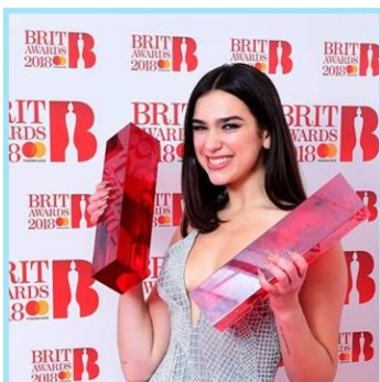
A Recap of the BRITs

Food—Music—Celeb—Conspiracy—March Conspiracy—Politics—Aunt Aggie—Film—Sport