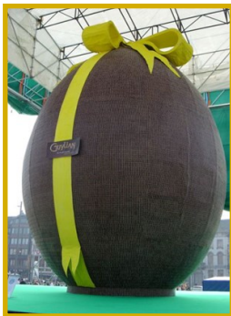
World's largest chocolate egg

It is tradition to eat fish on Good Friday because of the Roman Catholic custom to not eat warm-blooded animals on Fridays to acknowledge Christ's death. Because fish comes from the sea, it was perceived to be a different kind of flesh so it was okay to eat this instead. McDonald's brought out the Filet-O-Fish because a franchise owner in America noticed that hamburger sales were falling on Fridays due to the Roman Catholic custom.