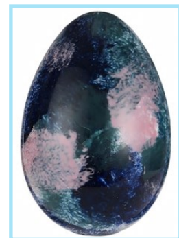
Top 5 Most Ridiculous Easter Eggs