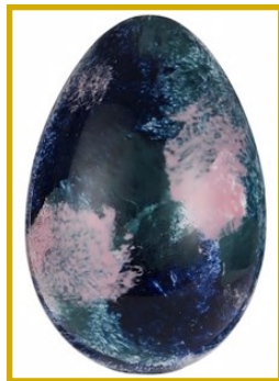
Selfridges Selection Easter egg