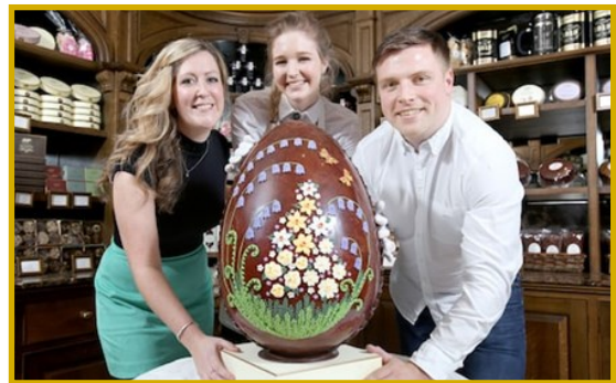
Betty's Imperial Easter egg