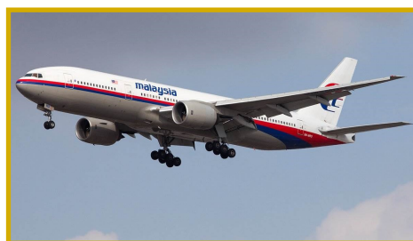
MH370—where the heck did it go?